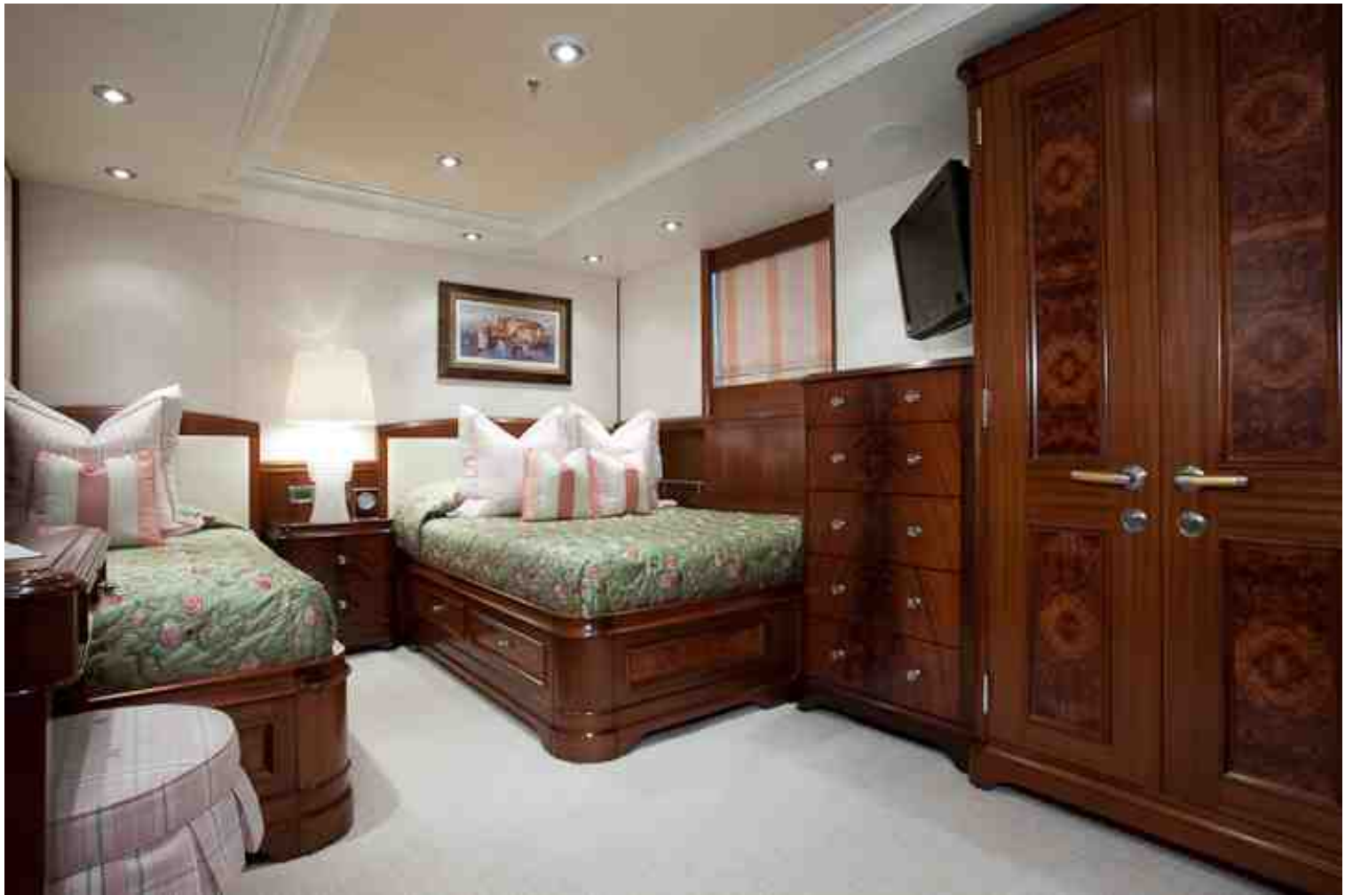
Katya guest room