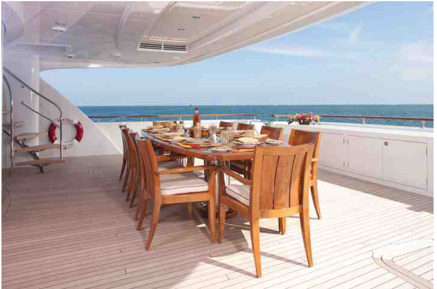
Main deck dining aft