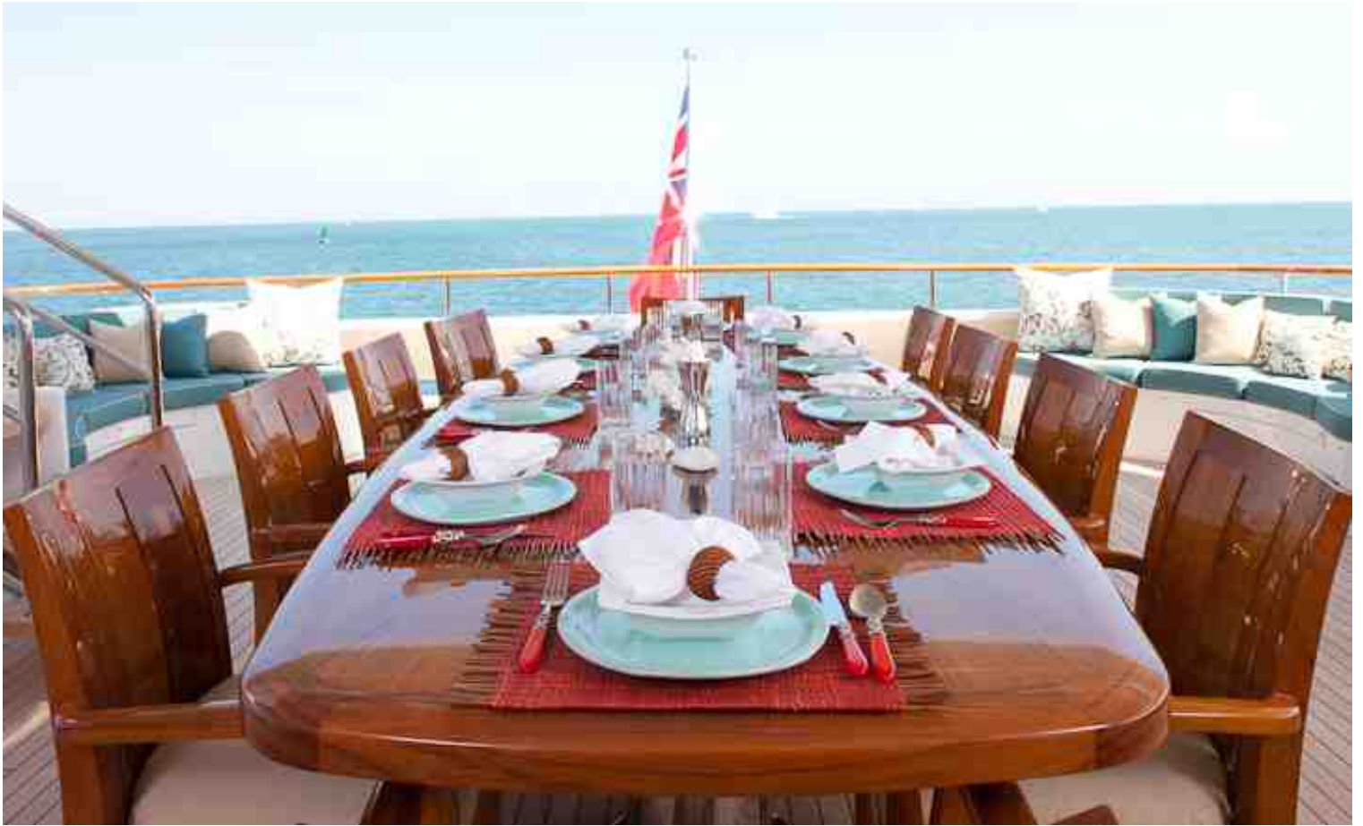
Upper deck dining aft