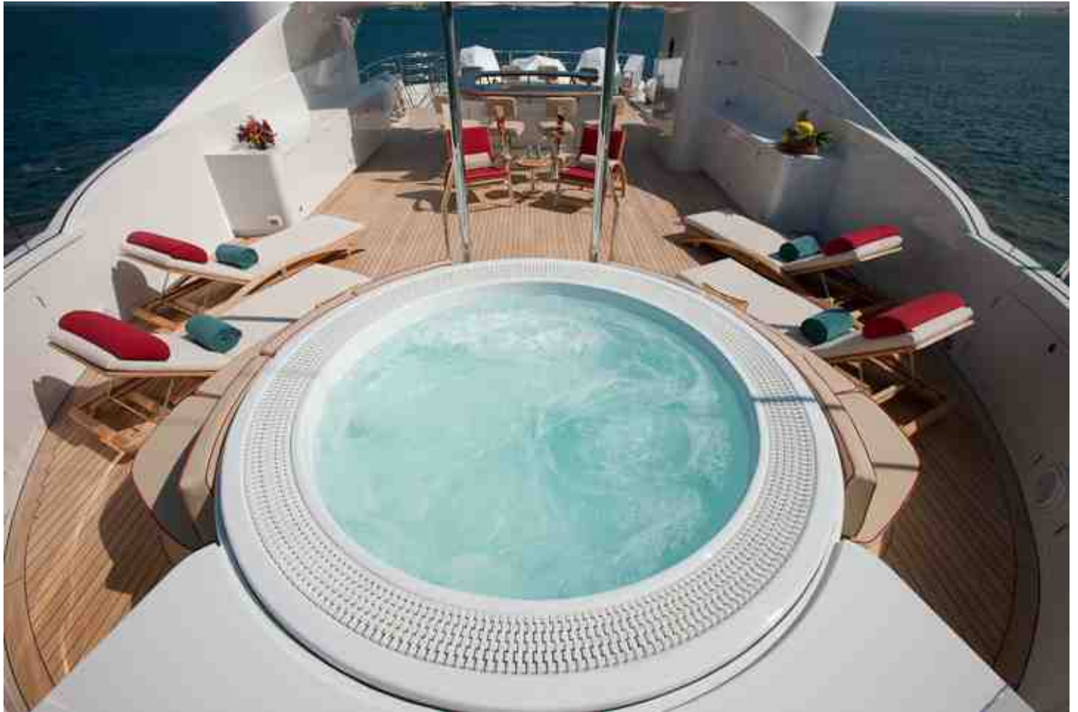
Jacuzzi and sundeck